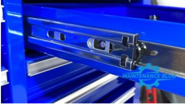
US General Toolbox Drawer Slide

The US General drawer slides are sufficient, and they move smoothly. However, do not believe for one second that they compare to a Snap-On or equivalent. Harbor Freights comparison is silly. Keep in mind unless you have very heavy tools that require a Snap-On professional level toolbox, the US General is probably more than adequate.