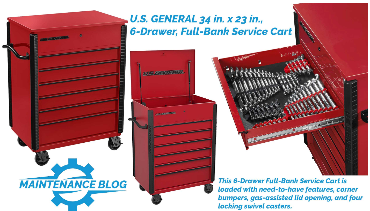
U.S. GENERAL 34 in. x 23 in., 6-Drawer, Full-Bank Service Cart

This 6-Drawer Full-Bank Service Cart is loaded with need-to-have features, corner bumpers, gas-assisted lid opening, and four locking swivel casters.