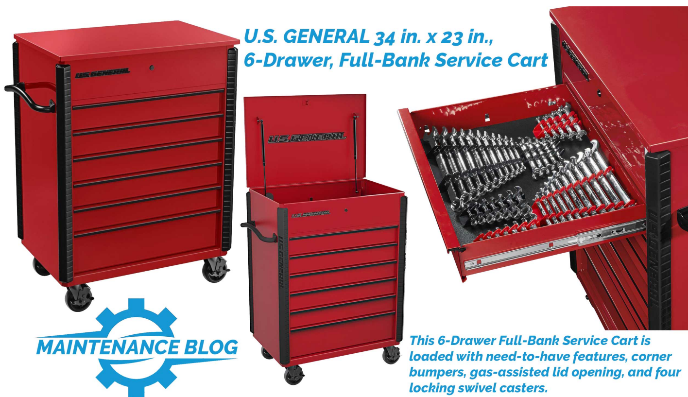
U.S. GENERAL 34 in. x 23 in., 6-Drawer, Full-Bank Service Cart

This 6-Drawer Full-Bank Service Cart is loaded with need-to-have features, corner bumpers, gas-assisted lid opening, and four locking swivel casters.